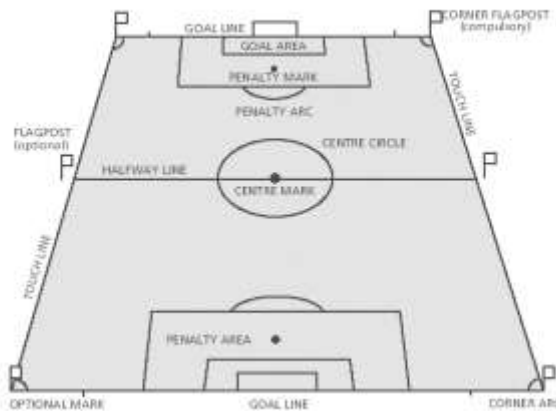
The Field of Play

Notes: -The Penalty Box includes the Goal Box